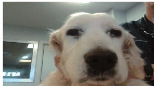
Apathy and muscular atrophy