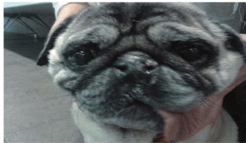
Blepharitis and ulcerative nasal dermatitis